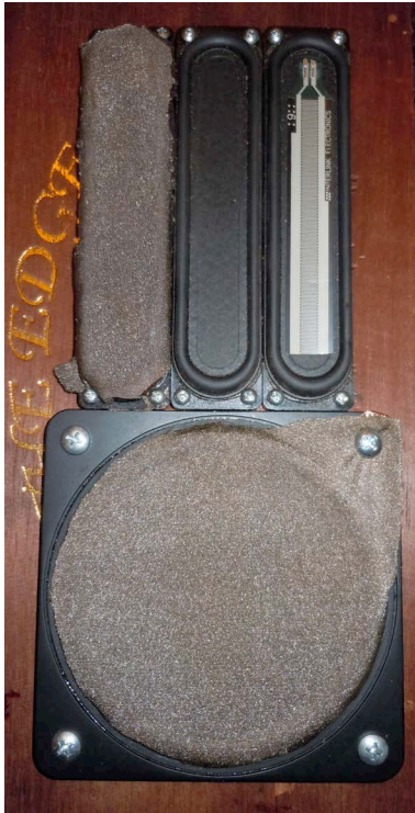
Figure 3. Haptic Speakers, fabric (top left and bottom) and commercial FSR (top right).